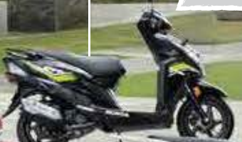
Pearl Deep Ground Gray