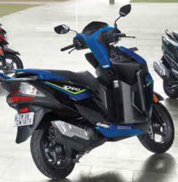
Pearl Siren Blue